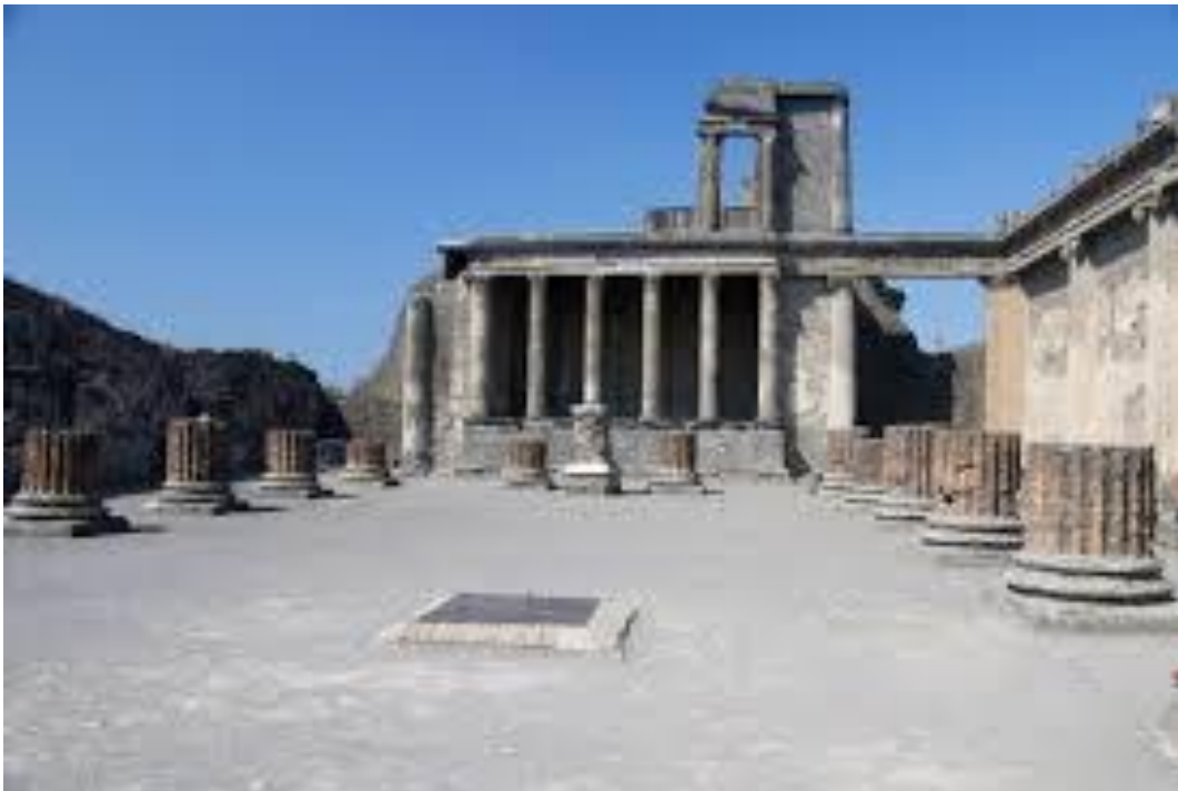
Remains of the basilica at Pompeii

The "basilica" were the "duoviri" ( the chief officials of the town) sat to hear lawsuits and where businessmen could have meetings.