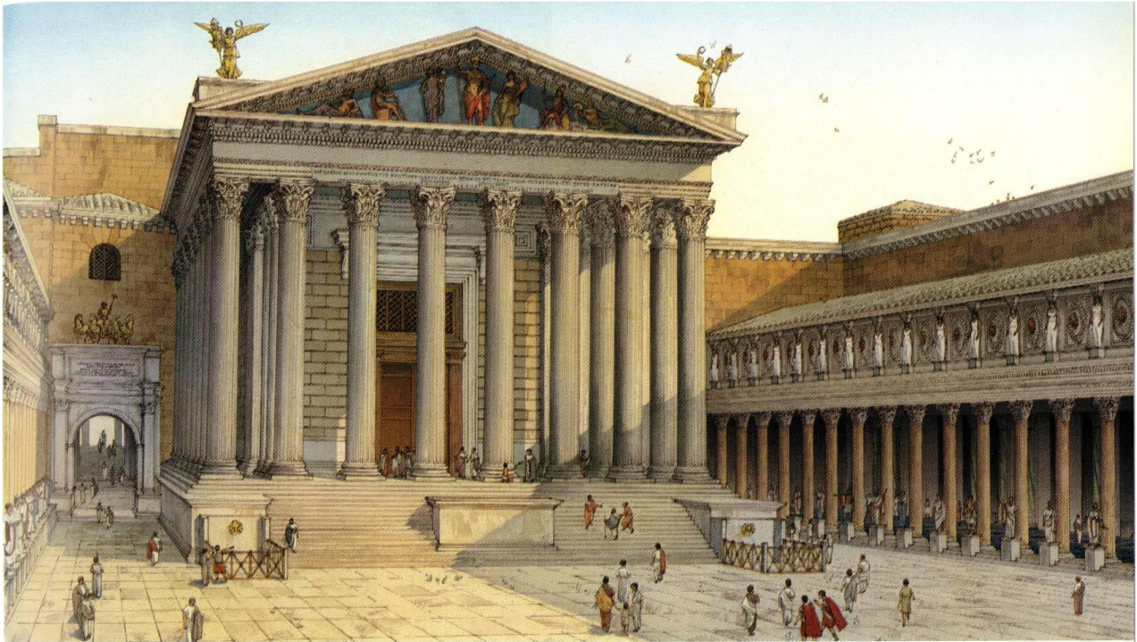
Temple of Jupiter