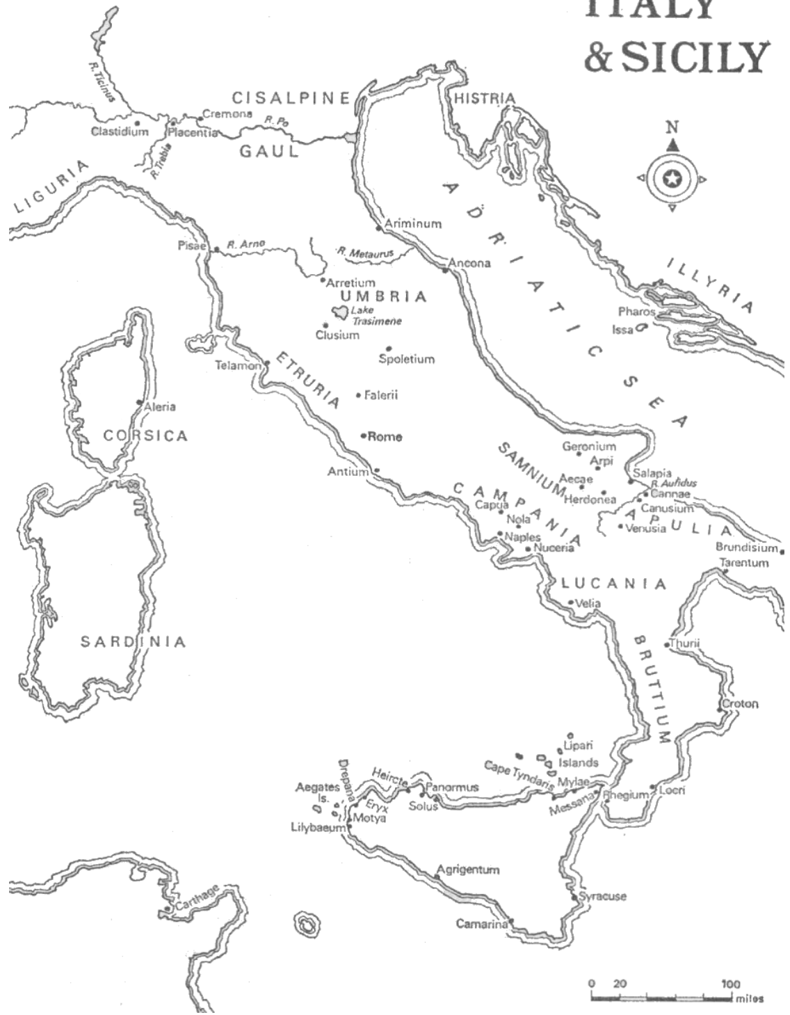
The Central Mediterranean 264 B.C.